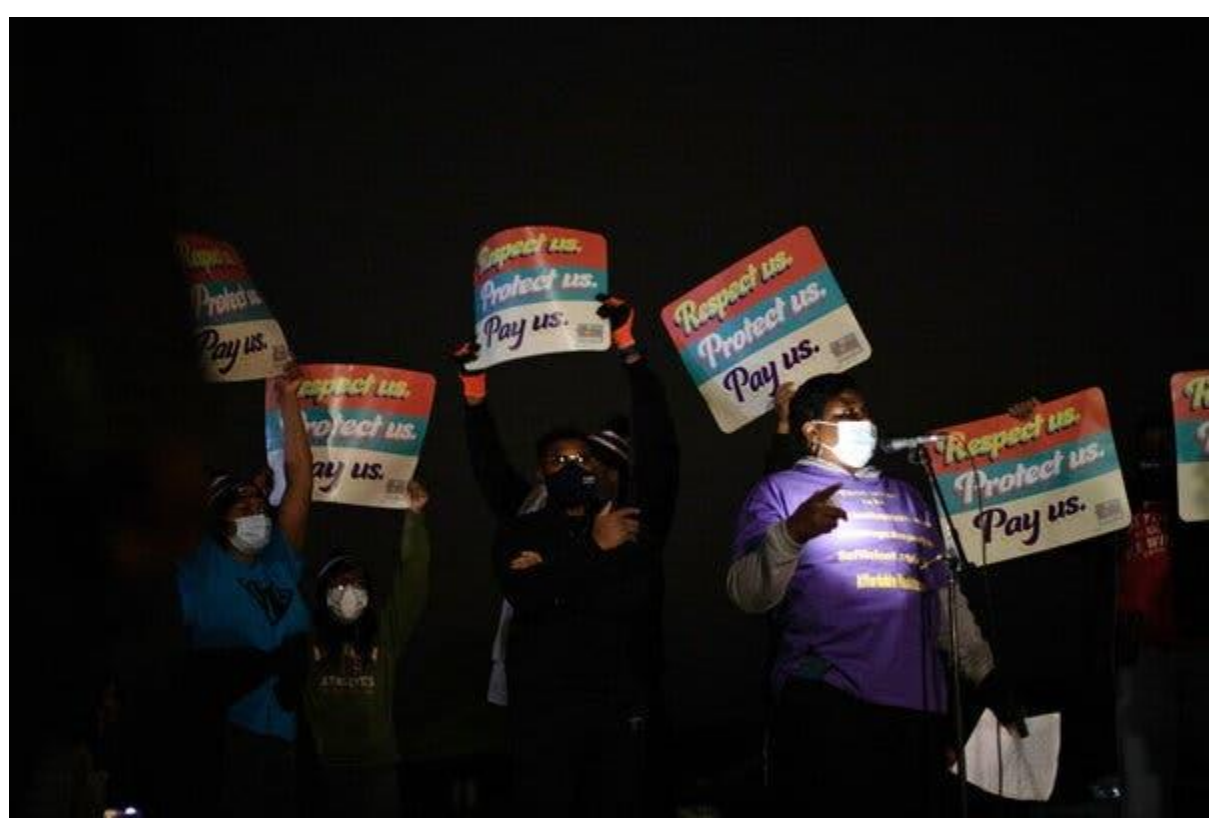
Employees of the Four Seasons Rehabilitation and Nursing in Westland, Mich., demonstrated for better pay and protections during an outbreak of Covid-19 in October.

Further complicating matters, the different priority groups discussed by the C.D.C. committee are overlapping — many essential workers have high-risk conditions, and some are older than 65. Some states have suggested that they will prioritize only essential workers who come face to face with the public, while others have not prioritized them at all.