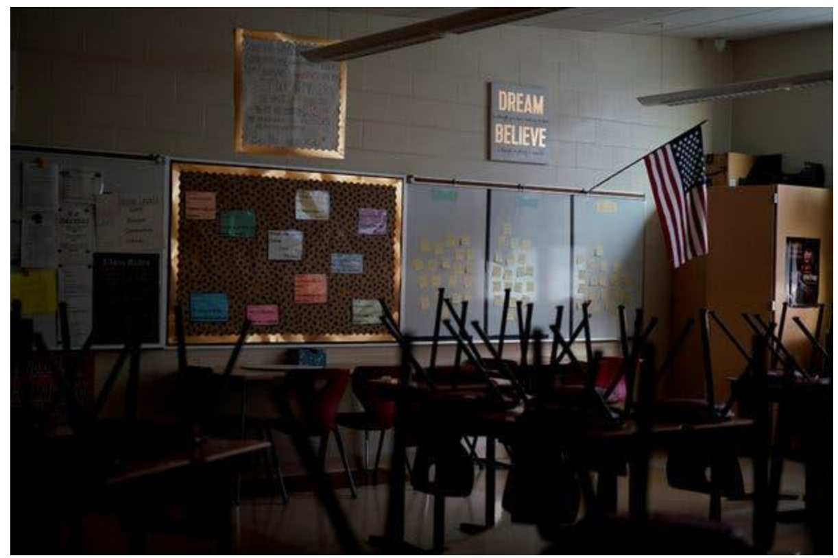
An empty classroom in Ohio. Public health experts disagree on whether teachers should get a top priority for the vaccine.

"When you talk about disproportionate impact and you're concerned about people getting back into the labor force, many are mothers, and they will have a harder time if their children don't have a reliable place to go," she said. "And if you think generally about people who have jobs where they can't telework, they are disproportionately Black and brown. They'll have more of a challenge when child care is an issue."