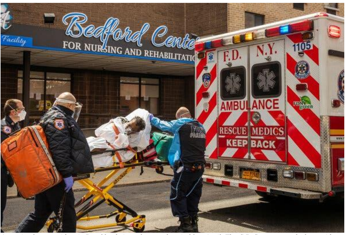
A nursing home resident in Brooklyn being taken to a hospital last April. The C.D.C. recommends that residents of long-term care facilities, along with health care workers, get the very first vaccines.

Some health policy experts said that to prioritize preventing deaths rather than reducing virus transmission was simply a pragmatic choice, because there won't be enough vaccine initially available to make a meaningful dent in contagion. A more effective use of limited quantities, they say, is to save the lives of the most frail.