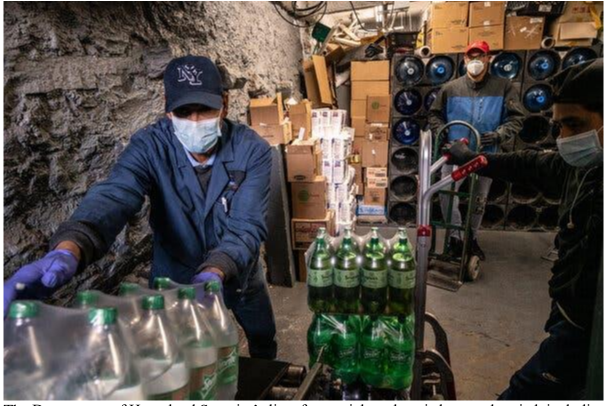
The Department of Homeland Security's list of essential workers is long and varied, including jobs such as tugboat operators and these grocery store clerks in Brooklyn.

The C.D.C. will soon decide which group to recommend next, and the debate over the trade-offs is growing heated. Ultimately, states will determine whom to include.